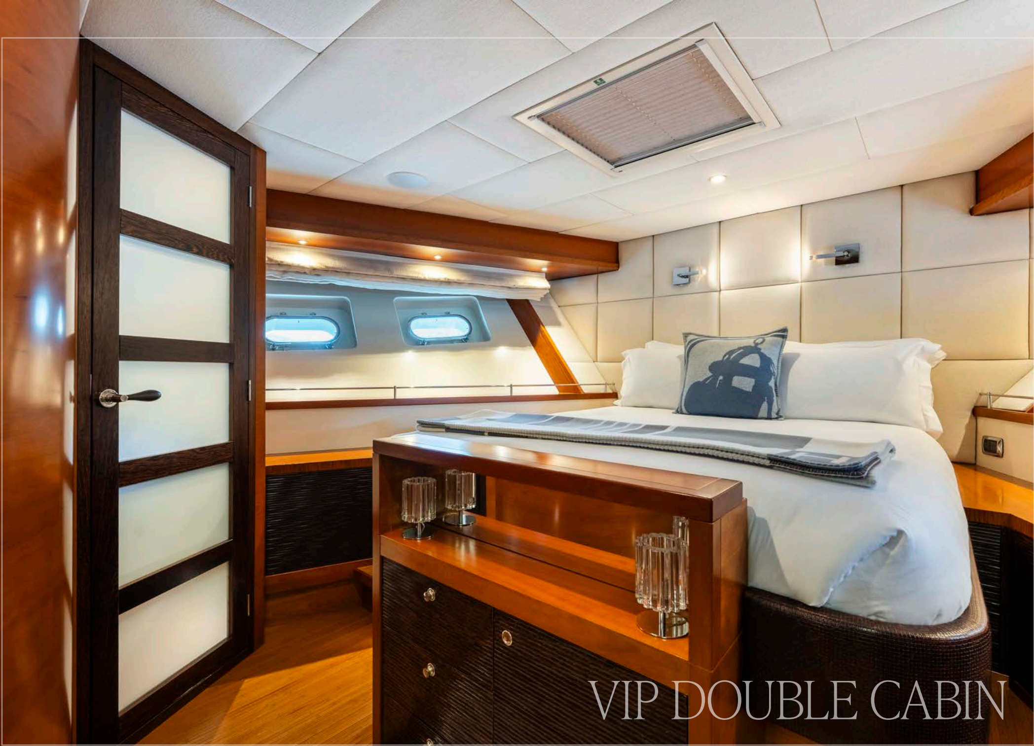
VIP DOUBLE CABIN