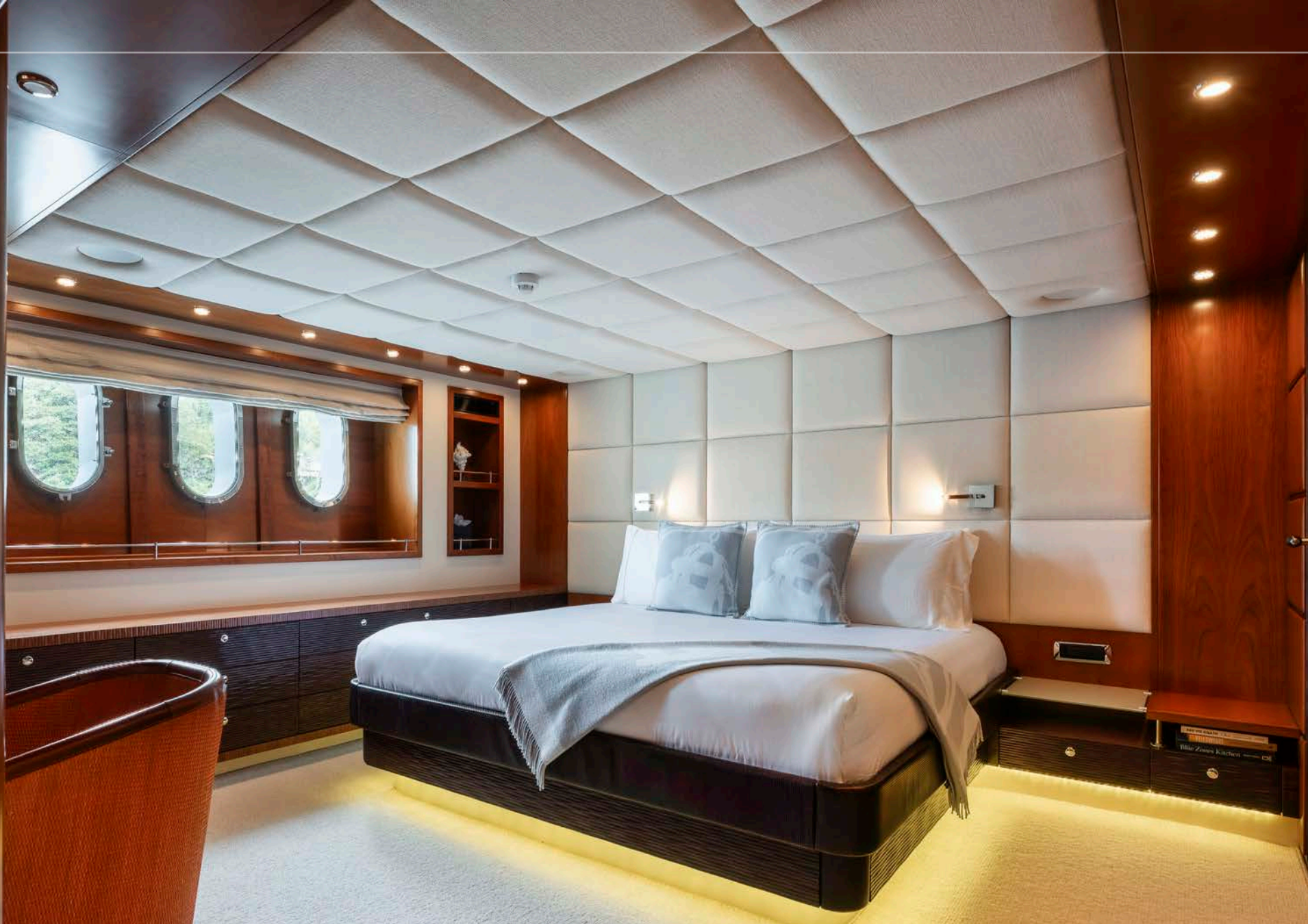
MASTER DOUBLE CABIN